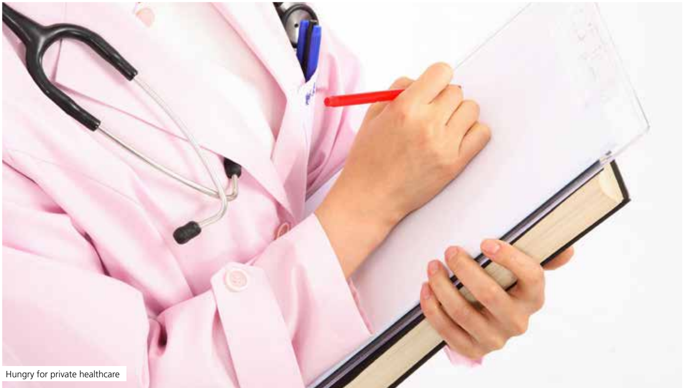
Hungry for private healthcare